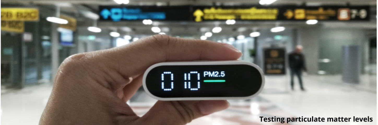
Testing particulate matter levels

Architects, engineers, and construction professionals are constantly seeking ways to improve the energy efficiency of buildings to increase comfort and control costs. Installing vapor barriers, insulating walls and ceilings, and placing seals around windows and doorframes allow air-conditioning and heating systems to work more effectively. However, these measures also decrease the rate of exchange between outdoor and indoor air, trapping pollutants such as smoke, vapors, mold, and chemicals inside. This can have short- and long-term health effects on the people who live and work in these buildings.