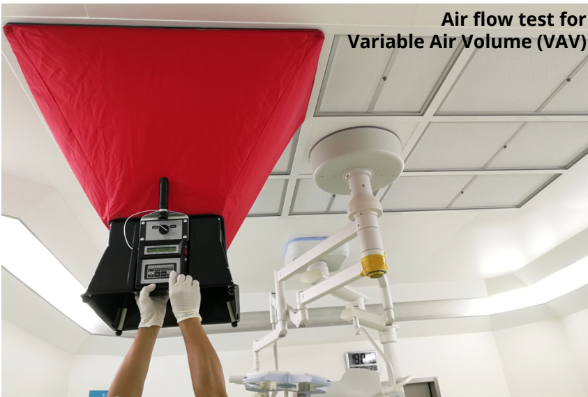
Air flow test for Variable Air Volume (VAV)