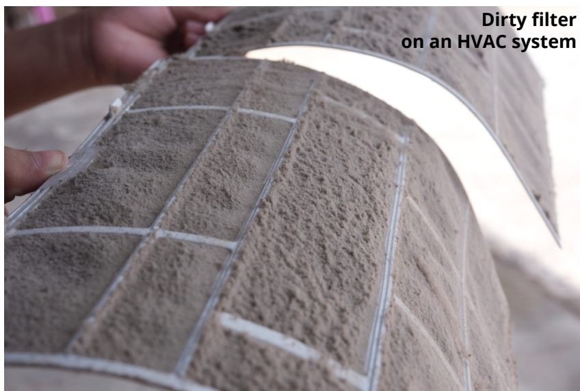
Dirty filter on an HVAC system

Commercial-grade equipment, such as air scrubbers, dehumidifiers, and air purifiers, is a great way to keep indoor air quality at good levels and prevent the need to hire professionals.