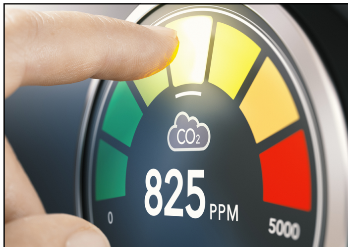
Testing of carbon monoxide (CO 2 ) levels = 825 parts per million (PPM).

Exposure to indoor VOCs can cause a variety of health effects, including eye, nose, and throat irritation, headaches, loss of coordination, nausea, and damage to the liver, kidneys, or central nervous system. 10 Some VOCs are also suspected or proven carcinogens, such as formaldehyde, which can cause nose and throat cancer , and benzene, which can cause leukemia. 11 Others, such as high-level exposure to methylene chloride, often found in adhesives, paints, and other building and maintenance products, can result in loss of consciousness and irreversible brain damage. 12 Also, long-term exposure to high levels of para-Dichlorobenzene (p-DCB), a common