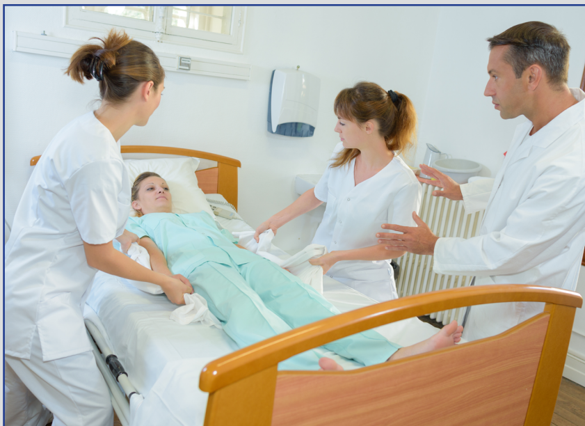
Figure 1 - Health care workers use a transfer sheet to reposition a patient.

Lifting devices, equipment, and aids Lifting devices, equipment, and aids are designed to reduce the internal and external forces that exert stress on the employee