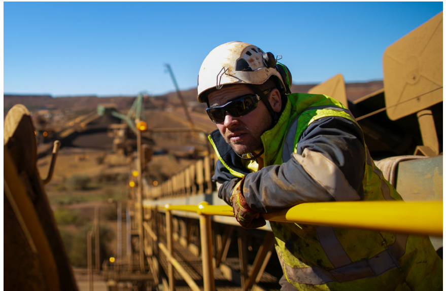
Table 1-Filter Lens Shade Numbers for Protection Against Radiant Energy

For adequate protection from the light produced by using lasers, welding, or other jobs that require exposure to radiant energy, OSHA recommends filtered lens for specific tasks: