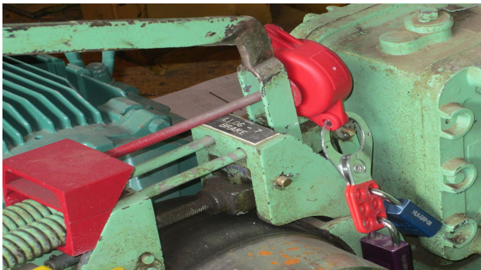
A lockout device applied to a hoist brake.

Fines for 2021 citations cost as much as $13,260 per violation. In addition, failure to act on the citations can lead to more penalties, up to $13,260 per violation per day past the deadline to fix the issue. 5